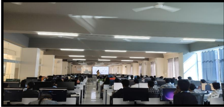
06-11-2024, 9:20 AM – 12:40 PM (ECE: Room No.7111)