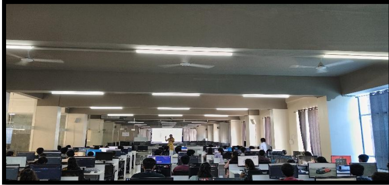
06-11-2024, 1:20 PM – 4:40 PM (AI&DS and CSE (AI&ML): Room No. 7111)