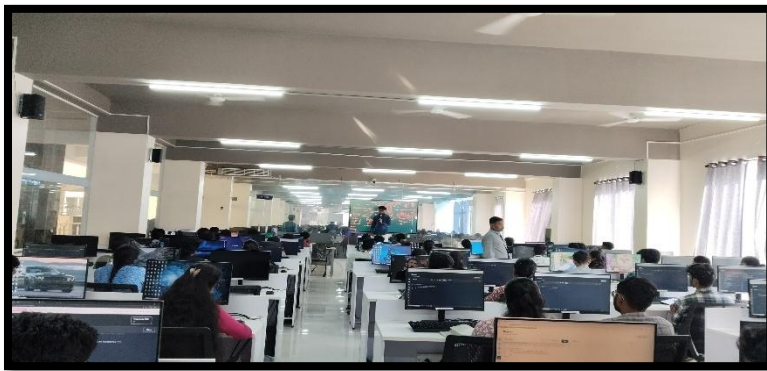
06-11-2024, 9:20 AM – 12:40 PM (ECE, CSE and CSE(AI&ML): Room No.7112)