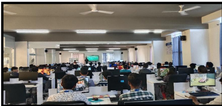
06-11-2024, 1:20 PM – 4:40 PM (AI&DS: Room No. 7311)